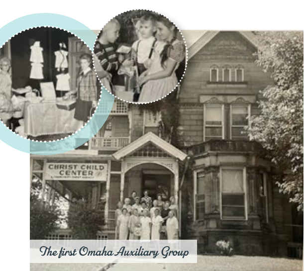
The first Omaha Auxiliary Group