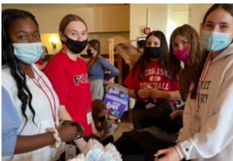
Layette Assembly, Duchesne Academy 2021 Event

MEMORIAL MASS & ANNUAL MEETING ~ November 29, 5:30 p.m., St Patrick's Catholic Church, Elkhorn